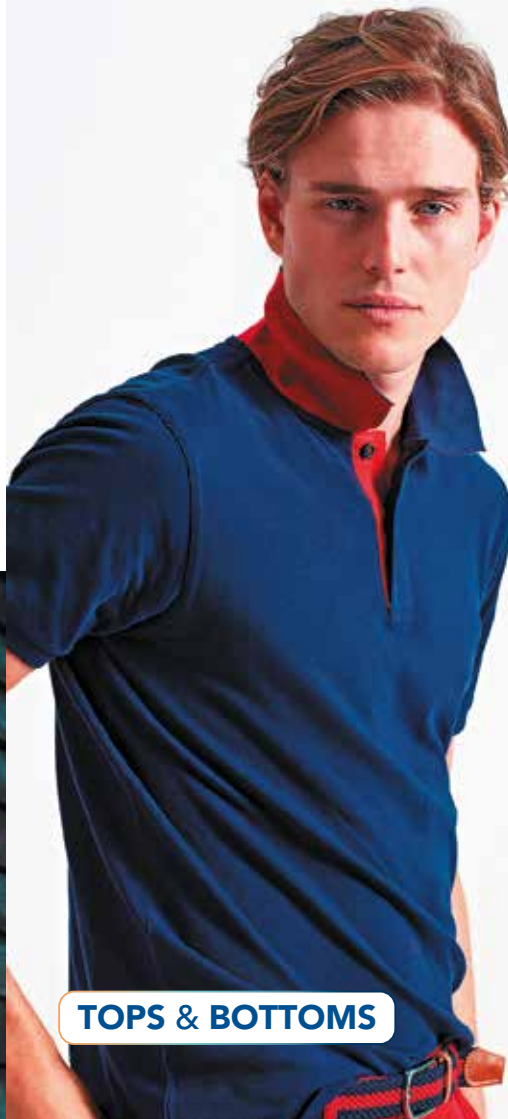
TOPS & BOTTOMS