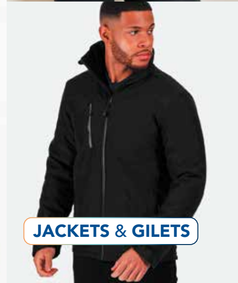
JACKETS & GILETS