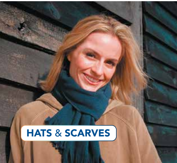
HATS & SCARVES