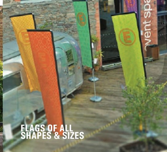
FLAGS OF ALL SHAPES & SIZES