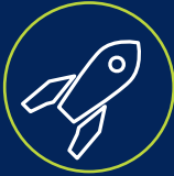
FAST EFFICIENT SERVICE