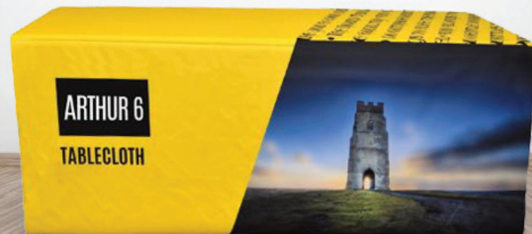
FITTED PRINTED TABLECLOTHS