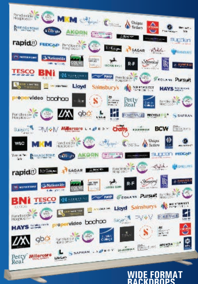
WIDE FORMAT BACKDROPS