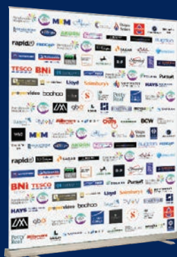
EXTRA-WIDE ROLLER BANNERS - UP TO 2M WIDTH

There's nothing quicker or easier to help set out your stall at an event than with a roller banner and tablecloth.