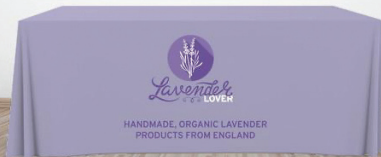
LOSE PRINTED TABLECLOTHS