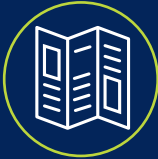
WIDE RANGE OF PRODUCTS