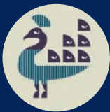
EXHIBIT & DISPLAY