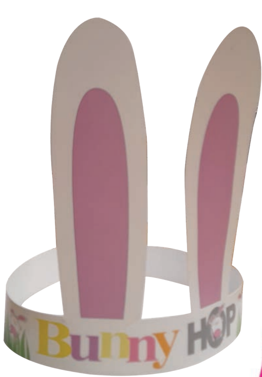
PRINTED CARD HEADBANDS